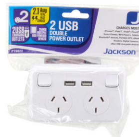
PT9822BK: Double GPO with 2 x 2.1 USB charging sockets