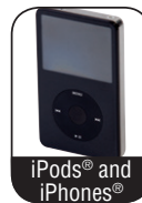
iPods® and iPhones®

iPad, iPhone & iPod are registered trademarks of Apple Inc. Bluetooth is a registered trademark of Bluetooth SIG.