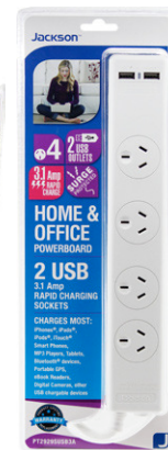
PT2929SUSB3A: 4 outlet 3.1 Amp USB powerboard